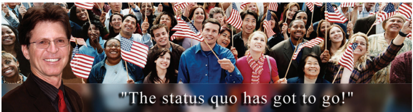
Fig. 2.2. My earlier website banner with the slogan “The status quo has got to go.”